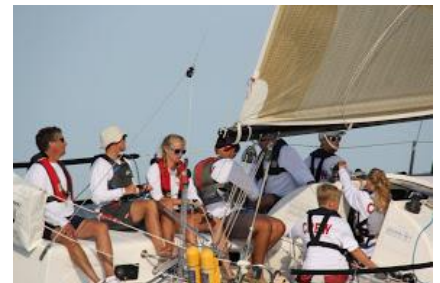
Figure 1 2015 Winner Quantum Leap

The course will be 60 to 100 miles in Block Island Sound or Long Island Sound with start and finish near Sea Flower Reef